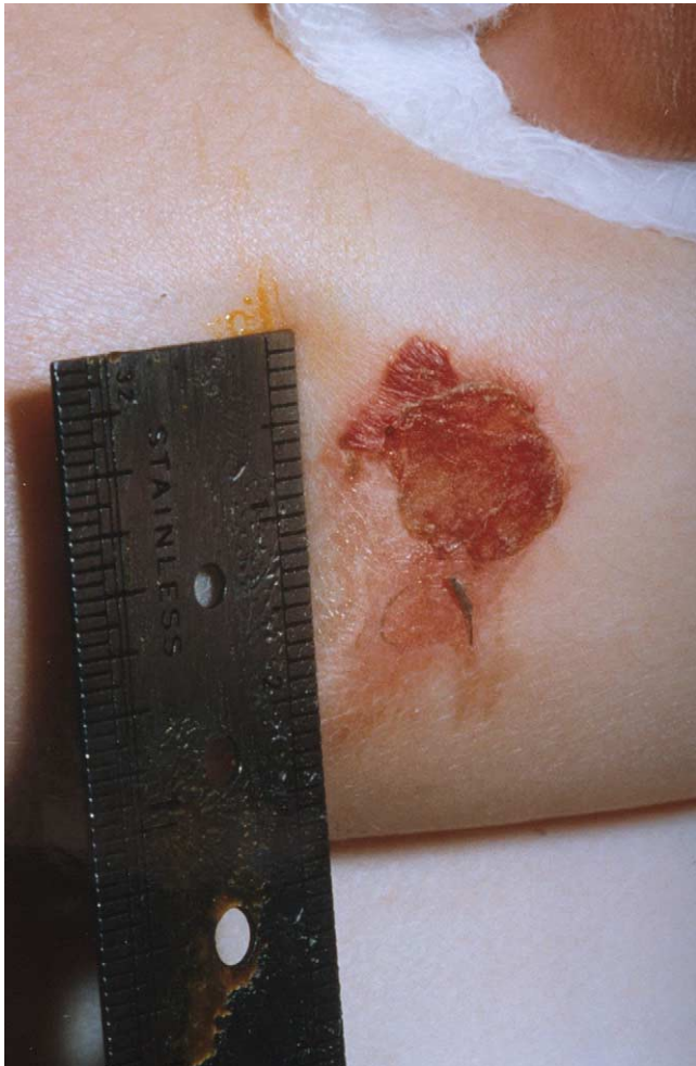
Fig. 1. Hot water splash marks.