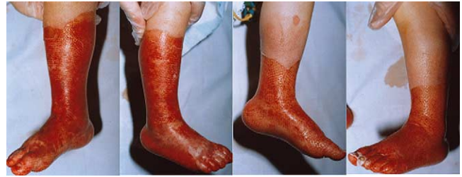
Fig. 2. The legs of a little boy who was forcibly immersed in a bath of hot water. These photos were taken 3 days after the burn and erythema is still just visible above the obviously burned skin on the left leg indicating that the original injuries would have appeared symmetrical, but during the 3 days since the injury the upper, superficial burn on the left leg has recovered and the corresponding area on the right leg has deepened. Beware of pictures and be aware that appearances change rapidly for various reasons after a burn injury and opinions given should take this into account.

a little boy who was forcibly immersed in a bath of hot water. cursory comparison of left and right legs suggests the legs were immersed to different levels and this is not a classical symmetrical “glove and stocking” scald distribution. However, these photos were taken 3 days after the burn. Erythema is still just visible above the obviously burned skin on the left leg indicating that the original injuries would have appeared symmetrical, meanwhile the upper, superficial burn on the right leg has deepened, but the corresponding area on the left has recovered. Time, dressings and physiology affect different parts of the same burn and alter the appearance of the burn—this must be borne in mind when offering opinions (especially on pictures of an injury) and highlights how crucial it is to photograph burns immediately, before pathological and physiological processes alter their appearance. In this case the abuser's defence barrister argued that the lack of symmetrical “stocking distribution” scalding “as described in the literature” meant this injury must be accidental—this argument was only unsuccessful because of the experience and expertise of the clinician who noted the salient points described above and integrated them all to rebut a defence rooted in medical dogma.