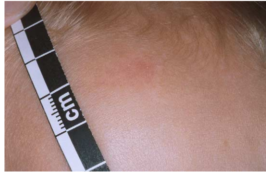
Fig. 4. A deliberately inflicted, 4-day-old cigarette burn to the forehead.

Burning with cigarettes leaves relatively superficial, circular or ovoid macular scars whereas inadvertent burns (small children blundering into a lowered adult hand holding a cigarette) are superficial and ill-defined. Depending on skin